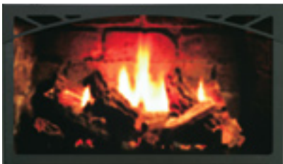
Top Half Black – ADTH