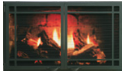
Straight Designer Door with Screen – DDS1