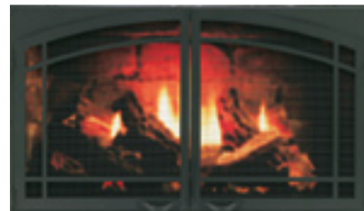
Arch Designer Door with Screen – DDA1