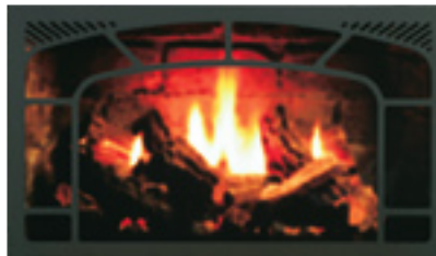
Deluxe Black – ADDX