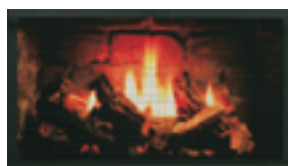
Child Safety Screen – CSS

NOTE: Antique, Polish Brass and Chrome Door Trims are available for Arch and Straight Designer Doors.