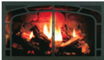
Double Door Arch Black – ADDD