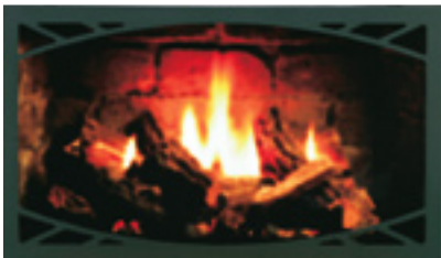
Double Black – ADDA